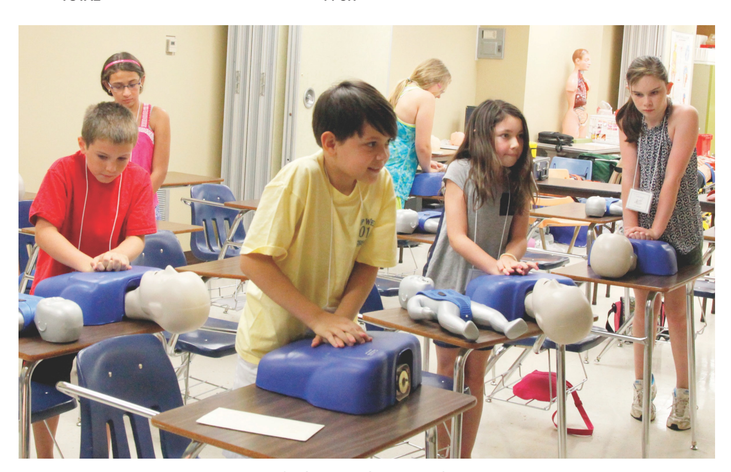
Learning Life Saving Skills at Camp Weevil

Students at Enterprise State Community College's annual summer camp learn basic Emergency Medical Skills For more information about the EMS program or to enroll call 1-334-347-2623.