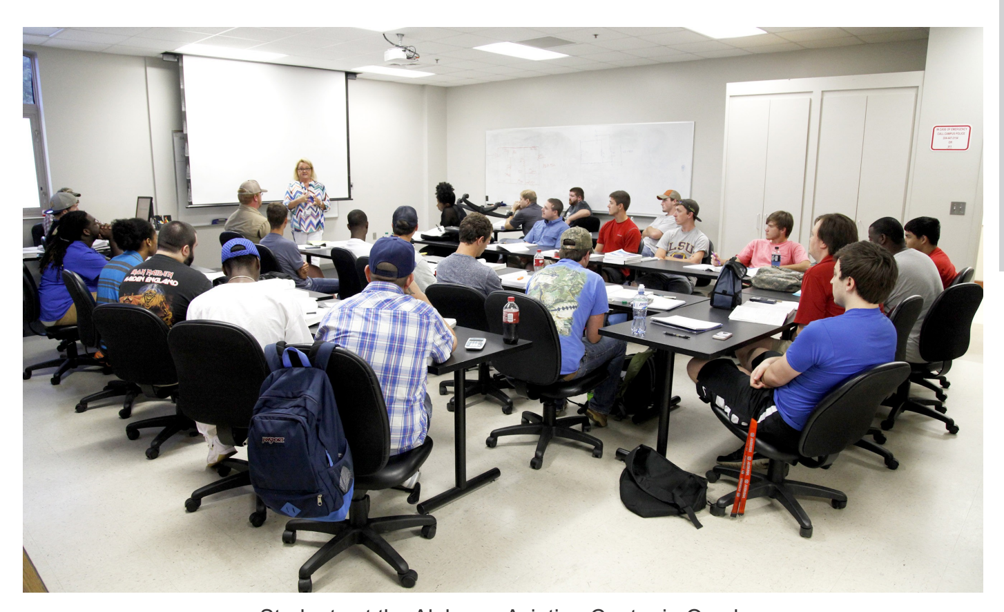
Students at the Alabama Aviation Center in Ozark